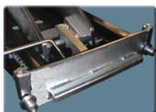
multi-level lock and HD steel