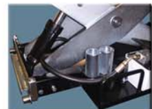
H.D hydraulics and adapter storage