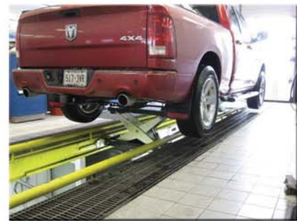
Stan Design rolling jacks

Stan Jacks feature; 6/7/9,000 lb. and higher capacities multi-level safety locks, H.D hydraulics, easy rolling wheels convenient pull handle & adapter storage extra high lifting & precision crafted components with zinc plating and powder coat paint